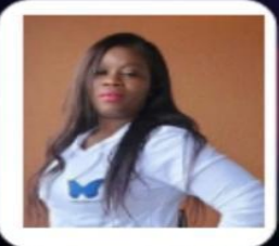
Peso K Vah